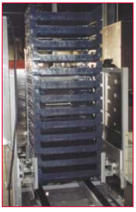
Exit, Basket Stacker (Capacity - 8 ft. / 2 m)